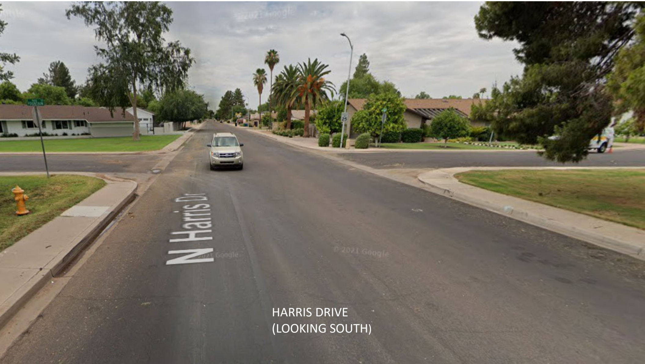
HARRIS DRIVE (LOOKING SOUTH)